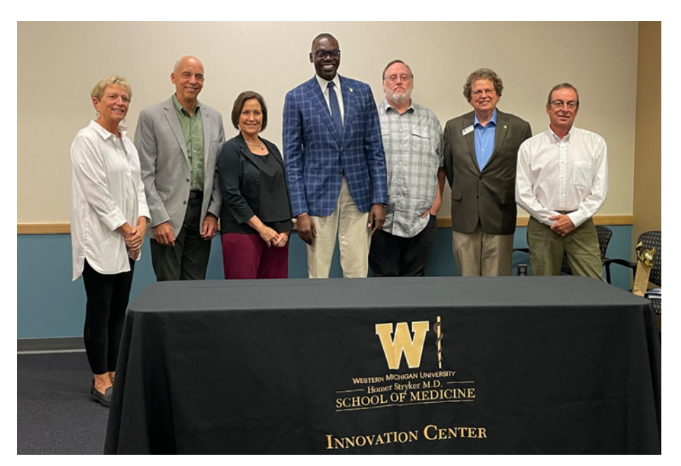
Elected officials and the honorees