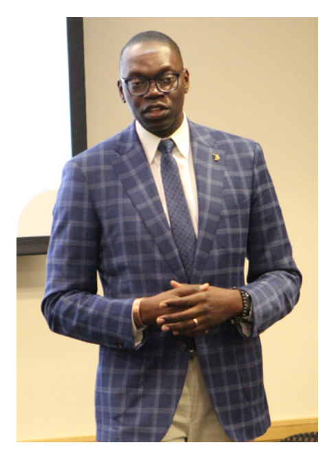
Michigan's Lt. Governor Garlin Gilchrist II